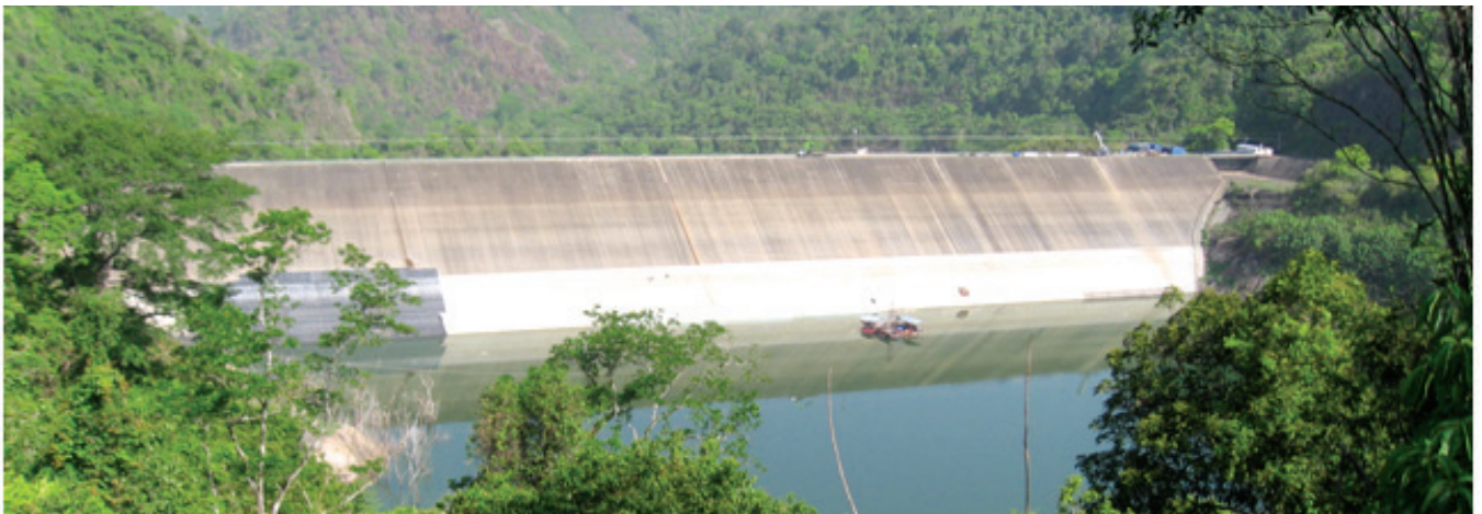
Fig.10. (Top) View of the upstream face of Turimiquire dam during the 1 st campaign of the waterproofing works; (bottom left) the downstream face before the waterproofing works and (bottom right) after the waterproofing works

to potentially jeopardize safety of the dam, both for the very severe working conditions. This dam exhibited leakage since its impounding, in 1989. Several repairs were performed placing first clay material, then other material of different granulometry. Each time, the repair seemed to have mitigated the leakage, but this was only for a short time. Leakage eventually rose to 9,800 l/s. Extensive investigation carried out with sonar multi-beam scanning showed some craters in the concrete slabs, extensive cracking and erosion at several locations. In May 2008 a preliminary decision was made to install an exposed SIBELON® geomembrane system. Since several cities in the Nueva Esparta State rely on this dam for supply of potable water, it was not possible to empty the