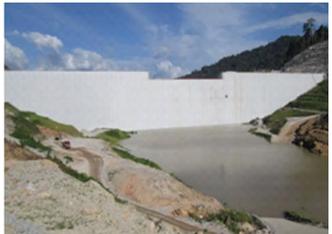
Fig.2. View of Susu dam during impoundment

safe operation of the dam until year 2000 were a series of slot cutting, and adraind exposed SIBELON® geomembrane system anchored to the dam face with a system of tensioning profiles (Carpi patent), which was installed in 1994 to provide waterproofing protection at the upstream face. This system was deemed the most adequate as: 1) in the event of an earthquake, the deformable and elastic geocomposite would bridge the cracks already existing and new cracks that should form, maintaining water tightness and reducing risk of hydro jacking; 2) it could stop water infiltrating into the dam body and feeding the AAR; 3) it would avoid the risk of uplift, thus maintaining the stability of the dam; 4) it would easily restore water tightness after slot cutting, providing reliable protection of slots; 5) efficiency could be monitored on a continuous basis due to the full face drainage system placed behind the waterproofing liner. In 2013, the owner EDF decided to carry out new slot cutting, and to make structural reinforcement by an upstream system of tendons and carbon bands, which required removing the geocomposite. The same geocomposite system was installed again, to protect the dam from seepage feeding under pressure. Rehabilitation works were successfully completed in 2014, granting a further extension of service to Chambon.