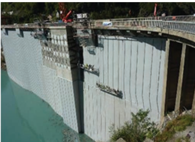
Fig.1. Installation of the SIBELON® geomembrane system at Chambon dam