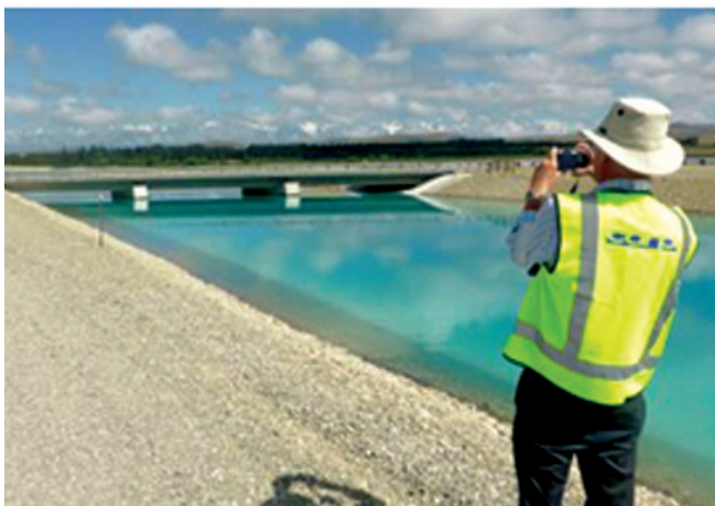
Fig.8. Tekapo canal after completion of the remedial works

guidelines issued by the Technical University of Munich [2] and based on a research conducted at the same university [3], for a water velocity of 2.1 m/s. Among the benefits of the exposed SIBELON® geomembrane system is the increased hydraulic efficiency. This is a result both of the very low micro-rugosity of the material itself and of the low macro-rugosity. In fact, the face anchoring systems mentioned in this paper are all conceived to make the liner smooth between the anchorage lines, with no wrinkles or folds. Wrinkles and folds are in general deleterious to durability of a geomembrane as they are potential locations of stress concentrations and, in the case of canals or hydraulic tunnels, also reduce hydraulic performance of the structure. A requirement to the geomembrane system installed at Pernegg was its natural appearance: this was obtained placing boulders in the upper part of the slopes. The SIBELON® geomembrane system was installed in a 2.1 km long section for a total of 48,000 m 2 . Installation was completed in 3 months, in 2010. Up to date, the geomembrane system performs as expected.