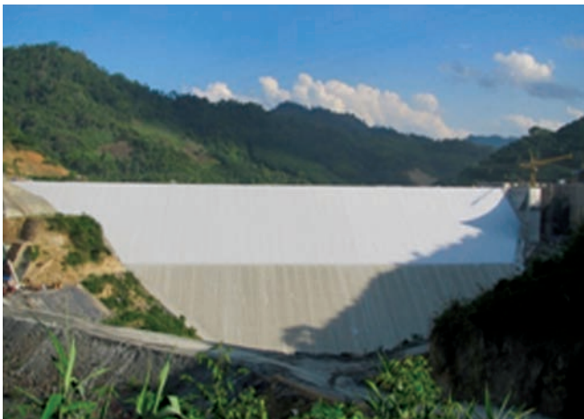
Fig.3. Nam OU VI rockfill dam after completion of the second stage installation of the exposed SIBELON® geomembrane system

original design of Susu dam conceived an RCC mix with a content of 100 kg/m 3 cement and 80 kg/m 3 fly ash, and a PVC geomembrane attached to pre-cast concrete panels used as formwork to place the RCC. This design was changed for an exposed, drained SIBELON® geomembrane system anchored to the dam face with the same patented system of tensioning profiles as at Chambon dam, which allowed a lower cement content in the mix of 95 kg/m 3 and enabled removal of the fly ash. Placement of the RCC, for a total of 731,000 m 3 , started in March 2014 and was completed in September 2015. Installation of the geomembrane system, which was planned so to match the construction schedule of the dam, started in June 2015 and was completed in January 2016. The reservoir was impounded shortly after the waterproofing works were completed. The same geomembrane system has been used also in rehabilitation of RCC dams. Examples are Grindstone Canyon (2015) and San Vicente (2013), both in USA. At San Vicente, the geomembrane was placed on the nearly 36 m heightening of the dam, the highest dam raising in the world using RCC. The primary design objective was for the dam to survive a large seismic event, remaining fully operational to provide an emergency supply of water to the San Diego region.