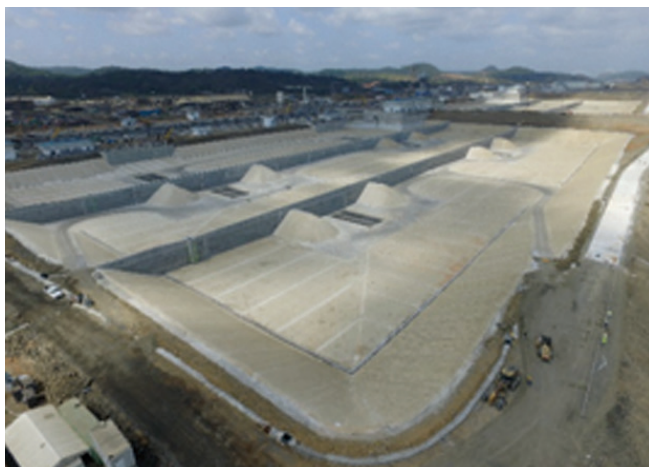
Fig.6. Aerial view of the Basins at the Pacific side upon completion of the waterproofing works

C.W. Bill Young , with a volume of 70 million cubic meters, provides water to Hillsborough, Pasco and Pinellas counties of Florida (USA). The reservoir, located in a county which is designated as a wildlife reserve, became operational in October 2005. The slopes of the reservoir were earthen embankment dams with a waterproofing geomembrane, soil-cement layer, a stair-step interior liner and an exterior grassed terrace. In 2006, abnormal cracks began to appear in more than about 40% of the reservoir's interior lining. Further investigations determined that the high pressure from water trapped in the soil wedge, below the soil cement, resulted in the cracking. Renovation of the reservoir started in 2012. A SIBELON® geocomposite was selected for a long-term repair, to replace the existing geomembrane. The adopted SIBELON® geocomposite is a 2-mm thick geomembrane