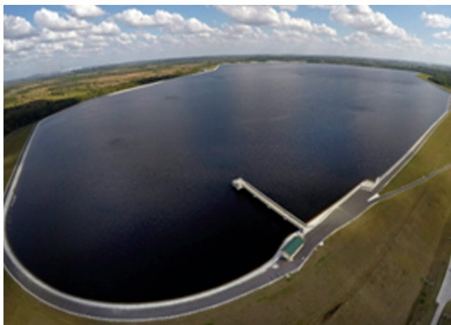
Fig.5. C.W. Bill Young reservoir in operation after rehabilitation, which included placement of a covered SIBELON® geomembrane system

the backfill. Installation was completed according to schedule despite the very harsh climate, with heavy rains and snow. To possibly achieve the goal of testing and commissioning of the first power unit of Rogun HPP within 2018, the SIBELON® is currently being extended up to elevation 1,065 m a.s.l, which corresponds to nearly 15 m heightening of the cofferdam.