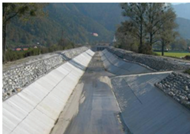
Fig.7. Pernegg canal after completion of the waterproofing works

The 18 Water Saving Basins that are part of the Panama Canal Expansion Project, which was inaugurated on 26th of June 2016, are of major importance for the project as these allow reuse 60% of the water in each transit. Therefore, watertightness is crucial to them. As this could not be granted only by concrete for the 100 years minimum functional life of the project, original design included a PVC geomembrane system covered with cast-in-place concrete slabs. The original design was changed in an exposed SIBELON® geomembrane system, designed to resist demanding load conditions that include: cyclic filling and emptying of the reservoirs up to 14 cycles a day, strong winds, large settlements, transit of vehicles, etc. Thanks to its flexibility, the system has undergone optimizations and changes to adapt to the specific site conditions. It consists of a SIBELON® geocomposite anchored in trenches, with tensioning profiles or with deep anchors, depending on the type and slope of the subgrade. Installation of the 591,600 m 2 geomembrane system has been completed in less than one year, in challenging weather and site conditions, fulfilling all contract requirements and passing all tests on completion. Selection of the exposed SIBELON® geomembrane system has resulted in a safer and cost-effective solution because of higher capability to maintain water tightness in presence of settlements and seismic events, of reduced amount of concrete involved, and shorter construction times.