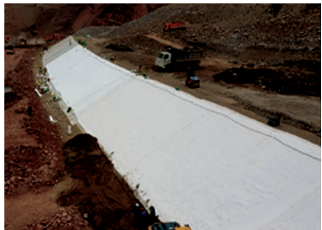
Fig.4. Installation of the SIBELON® geomembrane system in the Rogun upstream cofferdam

anchorage lines, also made of SIBELON® geocomposite, were constructed simultaneously to the dam body: after each raise of the embankment, a curb of high-permeability concrete was constructed at the upstream face of the dam, using an extruding machine; then, after strips of SIBELON® geocomposite were placed on top of the curb, at regular spacing, the embankment was further raised. Finally, the overlapping strips of SIBELON® geocomposite were heat-seamed to form continuous anchorage lines. This system is patented by Carpi. At Nam Ou VI dam, the geomembrane system was installed in stages, following construction of the embankment. The same system chosen for Nam Ou VI dam is currently being installed in a tailings dam under construction at 4,000 m a.s.l in the Andes. This dam, whose final height will reach 230 m, with its 120 m height is currently the highest dam in the world with a geomembrane as only waterproofing element.